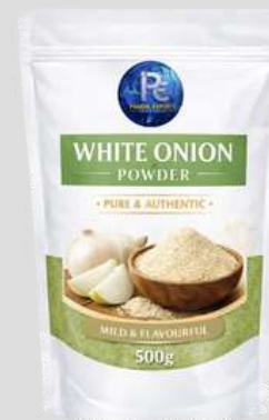
Red Onion Powder