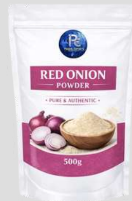
Red Onion Powder