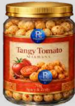
Tangy Tomato Makhana

We offer 10+ exclusive flavour innovations,crafted to suit global taste preferences and tailored to your market requirements.