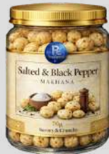
Black Paper&Salt Makhana