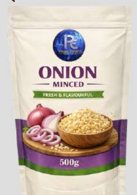
Red Onion Minced