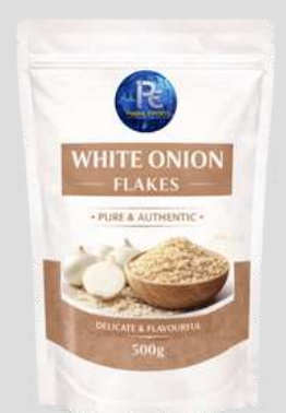
White Onion Flakes