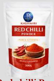
Red chilli Powder