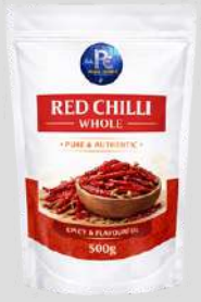
Red chilli Whole